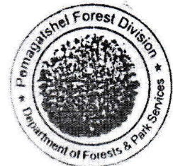
CHIEF FORESTRY OFFICER

Gamazor, Khar, Pema Gatshel. Phone No.: +97517810956 (CFO). 17150981 (General). 17150979 (ADM). Pema Gatshel Range: 07-471105. Yurung Range: 17764294. Nganglam Range: 07-481107. Email: pg_divisionoffice@googlegroups.com For any forestry services, visit our website https://ofs.dofps.gov.bt/