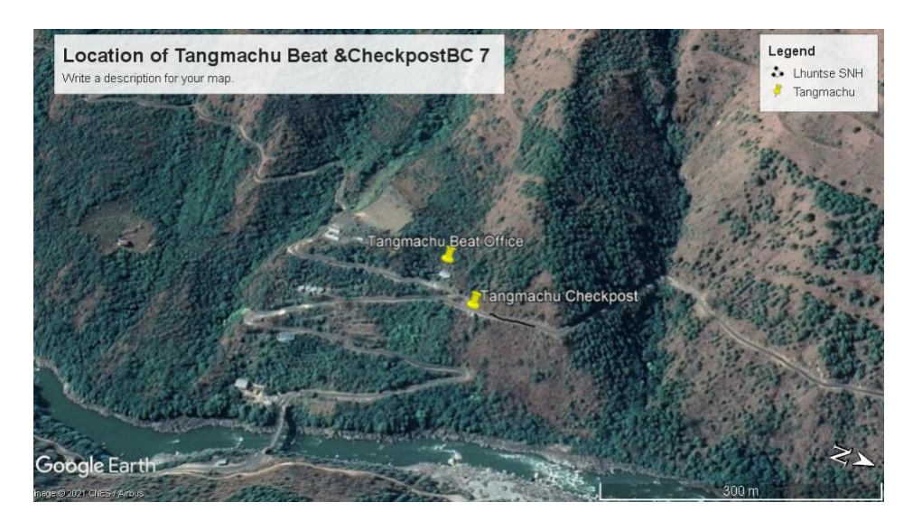
Condition of Checkpost at Tangmachu Beat Office