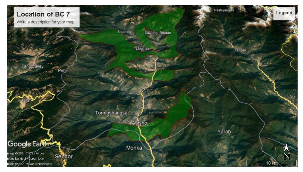
Map Showing Location of BC 7