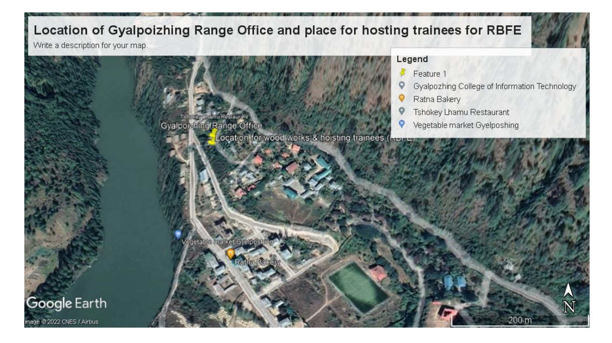
Figure 1: Proposed site for construction of temporary carpentry shed

The additional beauty of the 7<sup>th</sup> RBFE will be plastic free, where all flower pots shall be made of wood. After the training, those who are engaged in the capacity building will be engaged in making wooden flower pots of flower presentation. This will help encourage the local community engage in commercial business. As the preparation for the RBFE 7 has begun in November 2021 through to April 2022, the integration of RBFE 7 program and community could complement each other creating scope for community in floriculture skills and create scope for community to contribute.