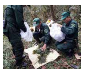
Figure 1: Field sampling

Forest plays an important role in global carbon cycle and sequestering atmospheric carbon (Djomo, Knohl, & Gravenhorst, 2011). The stored carbon in the forest and trees are manifested as biomass of tree or a stand. The aboveground biomass including herbs and shrubs constitutes the major carbon pool amongst the five terrestrial carbon pools and litter, below ground, woody debris and soil organic matter are other pools (IPPC, 2006). In the context of Bhutan, estimating the tree and forest biomass is important for quantifying the national carbon stock besides its potential application in the monitoring and estimation of carbon flux. This manual describes only the