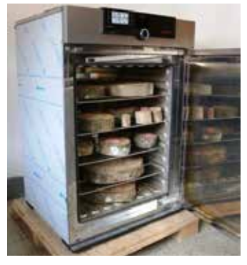
Figure 14: Drying of disc samples