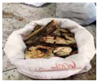
Figure 16: Deadwood sample