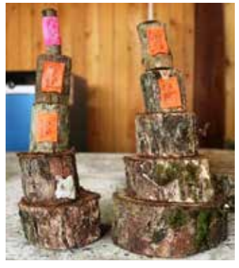
Figure 13: Two pathway samples