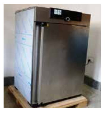
Figure 3: Electronic drying oven

The digital weighing balance is used to measure the dry weight of the samples after every prescribed interval (Fig. 4). For dry weight measurement, digital balance with precision level up to 1 gram is suitable for measuring the weight of the samples. The samples are dried at prescribed temperature in oven until it reaches constant dry weight.