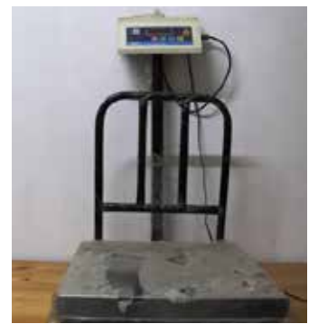
Figure 4: Electronic weighing balance