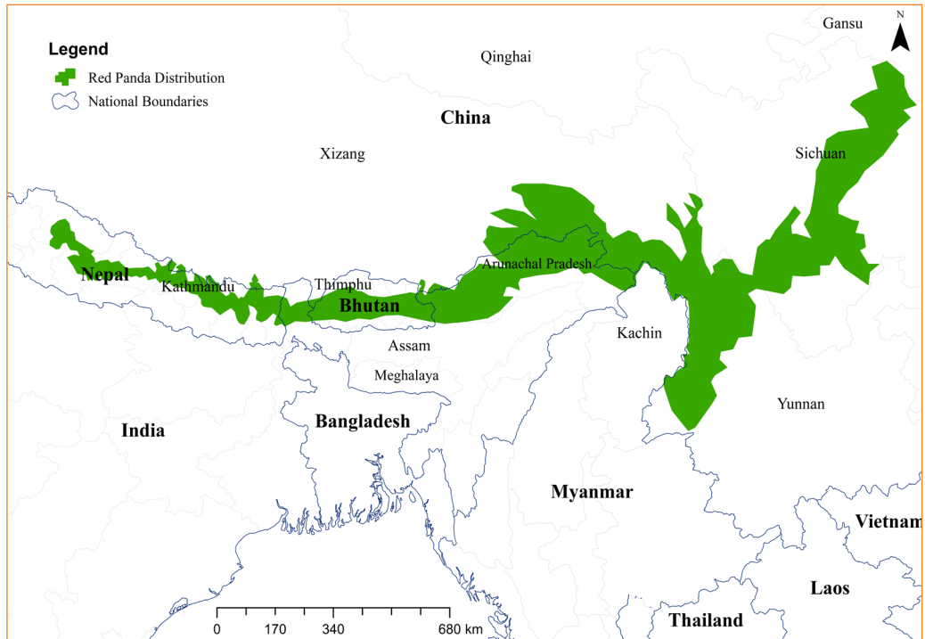
Figure 1: Distribution of Red Panda across the range countries

of red panda in Meghalaya, the species is known to occur at an elevation of 700m to 1400m exceptionally in a tropical forest (Choudhury, 1997) although there is no recent incidence of red panda sighting (indirect evidence of fecal pellets) or scientific study of the species in that locality (Ghose & Dutta, 2011).