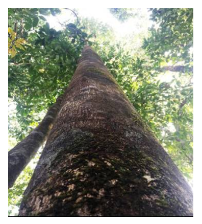
Figure 2. Matured Aquilaria species

Agar-wood is well known for its extraordinary aromatic properties and has three principal uses. They are most commonly used as essential ingredients to make medicines, perfumes and incense.