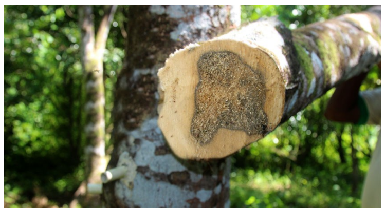
Figure 1. Agar-wood

Agar-wood is a valuable resinous wood that is produced from Aquilaria species, an evergreen tropical tree species. It is one of the most promising non-timber forest products (NTFP) in the world. They are referred to as "black gold" (Barden et al. 2000) and considered the most expensive wood.