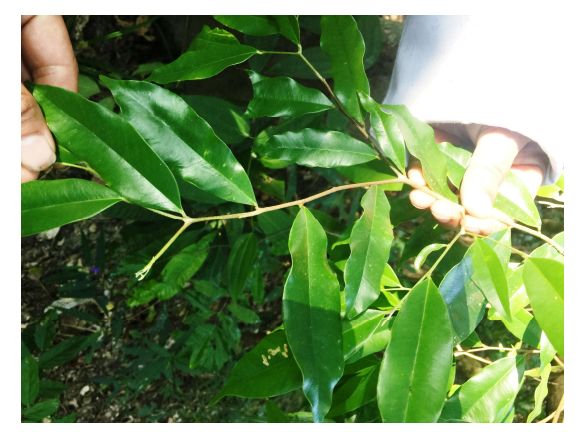
Figure 3. Leaves of Aquilaria species