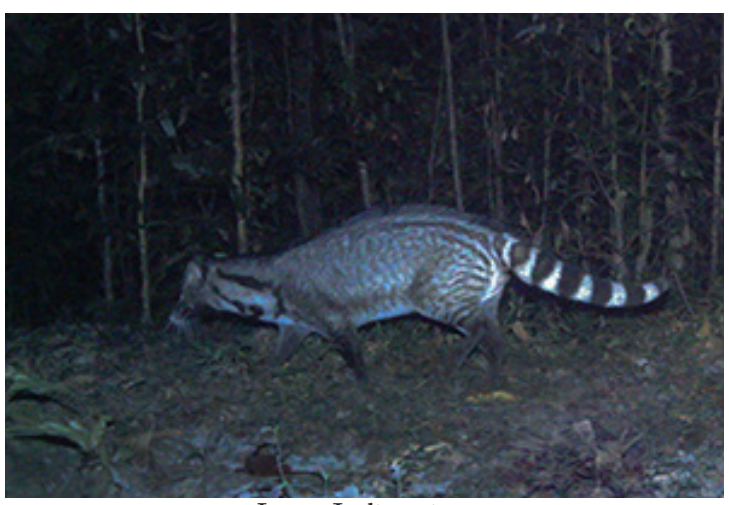
Large Indian civet Viverra zibetha Least Concern