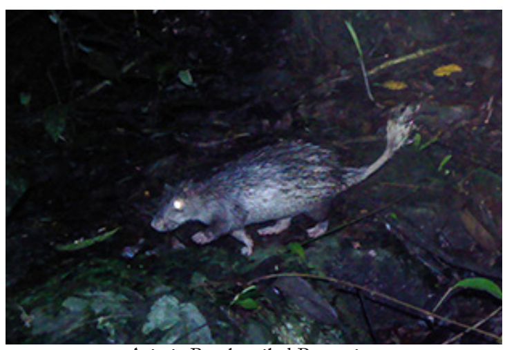
Asiatic Brush-tailed Porcupine Atherurus macrourus Least Concern