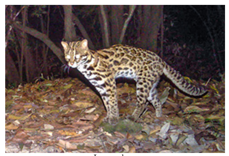
Leopard cat Prionailurus bengalensis Least Concern