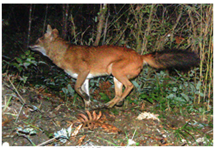
Wild Dog/ Dhole Cuon alpines Endangered