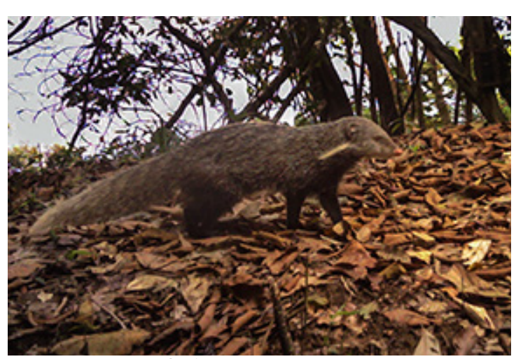
Crab-Eating mangoose Herpestes urva Least Concern