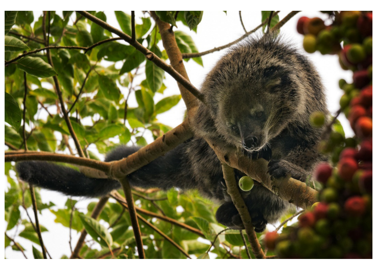
Binturong or Asian Bearcat Arctictis binturong Vulnerable