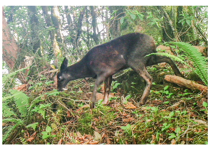
Himalayan Musk Deer Moschus chrysogaster Endangered