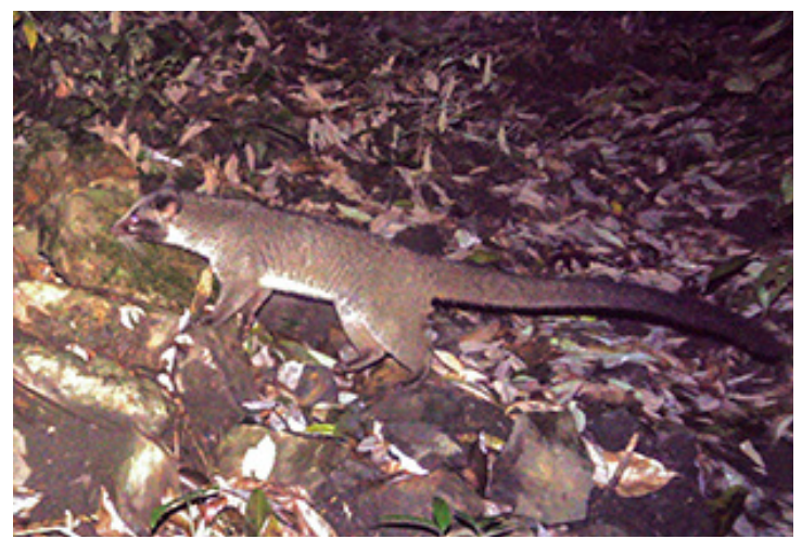
Himalayan Palm Civet Paguma larvata Least Concern