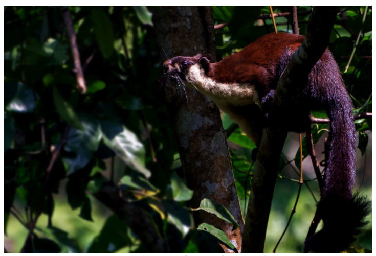
Himalayan Gaint Squirrel Ratufa bicolour Near Threatened