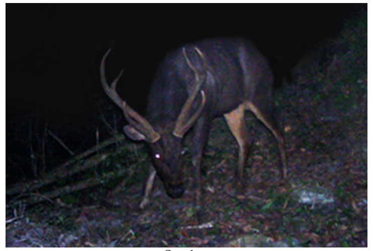
Sambar Cervus unicolor Vulnerable