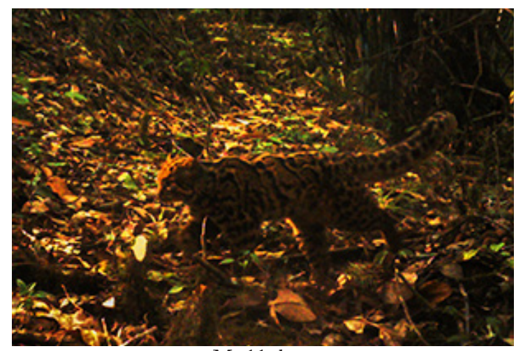
Marbled cat Pardofelis marmorata Near Threatened