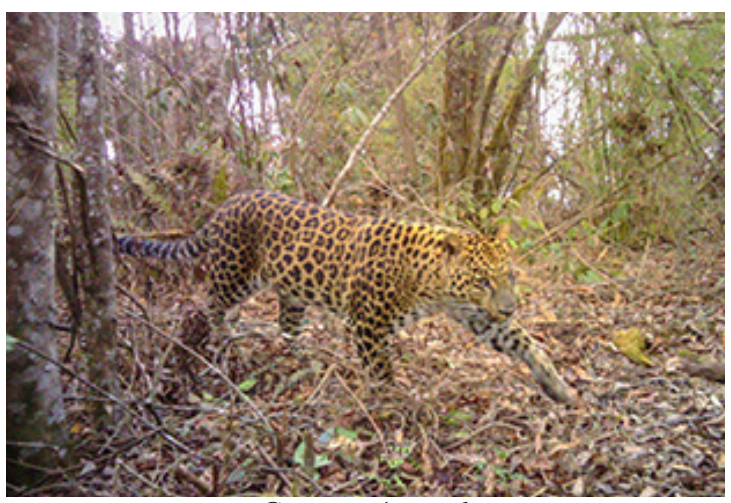
Common leopard Panthera pardus Vulnerable