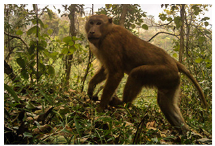
Assamese Macaque Macaca assamensis Near Threatened