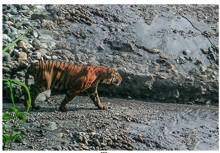
Tiger Panthera tigris Endangered