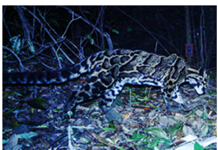
Clouded leopard Neofelis nebulosa Vulnerable