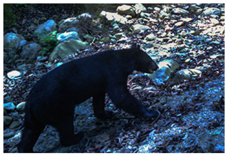
Himalayan Black Bear Ursus thibetanus Vulnerable