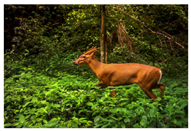
Barking Deer Muntiacus muntjak Least Concern