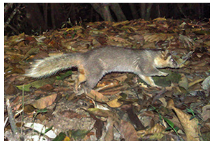
Large-Toothed Ferret Badger Melogale personata Least Concern