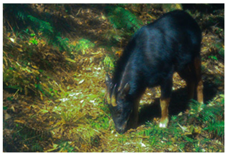
Himalayan Serrow Capricornis thar Near Threatened