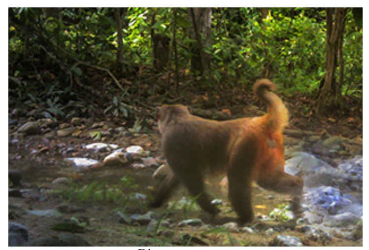
Rhesus macaque Macaca mulatta Least Concern