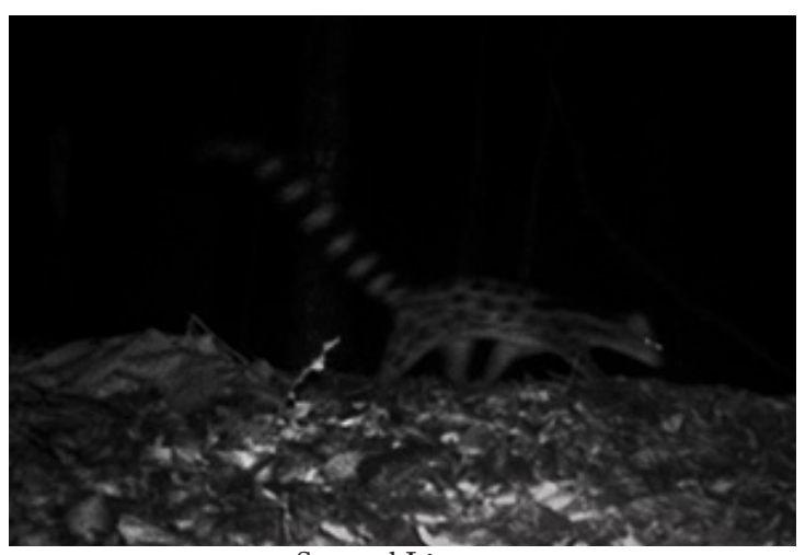
Spotted Linsang Prionodon pardicolor Least Concern