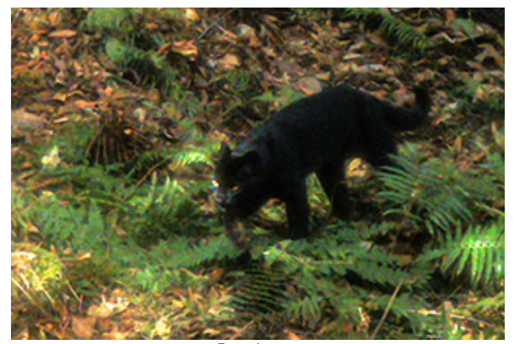
Jungle cat Felis chaus Least Concern