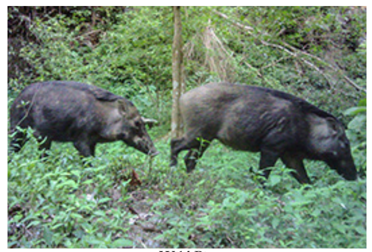
Wild Pig Sus scrofa Least Concern