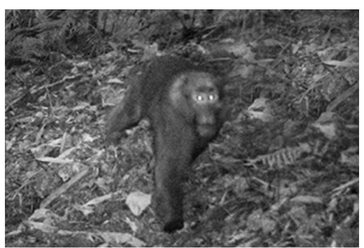
Arunachal Macaque Macaca munzala Endangered