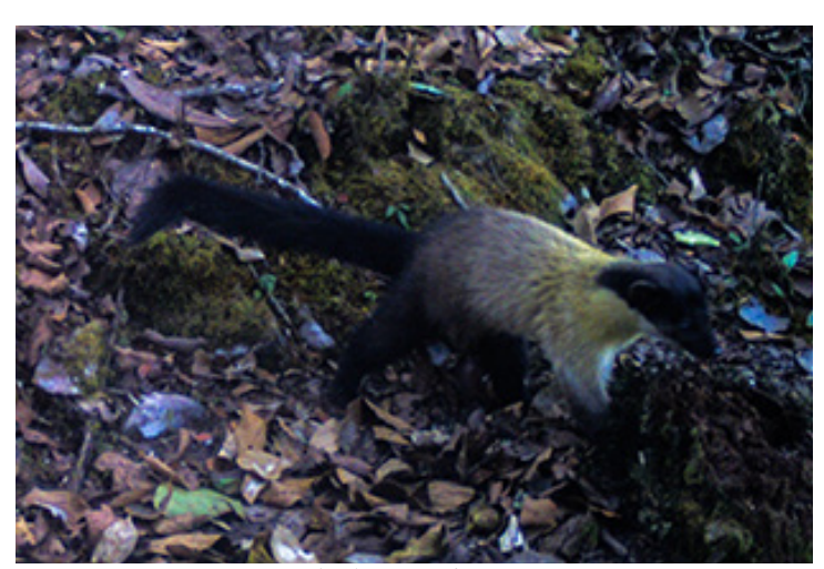
Black-naped Hare Lepus nigricollis Least Concern