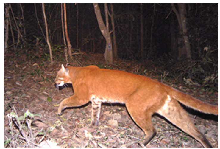
Asiatic Golden Cat Catopuma temminckii Near Threatened