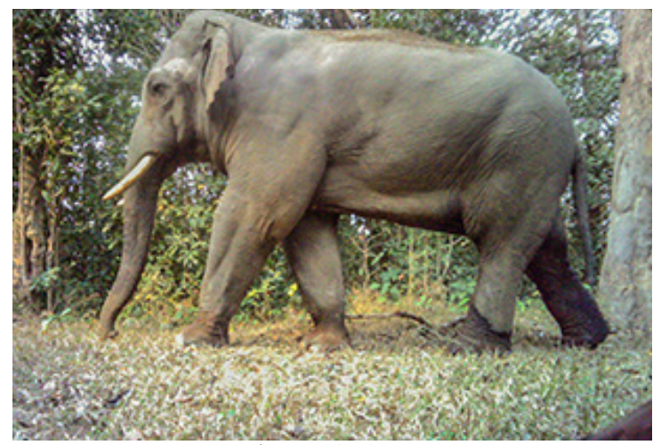
Asian Elephant Elephas maximus Endangered