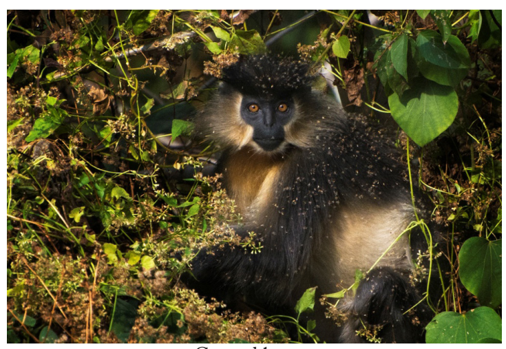
Capped langur Trachypithecus pileatus Vulnerable