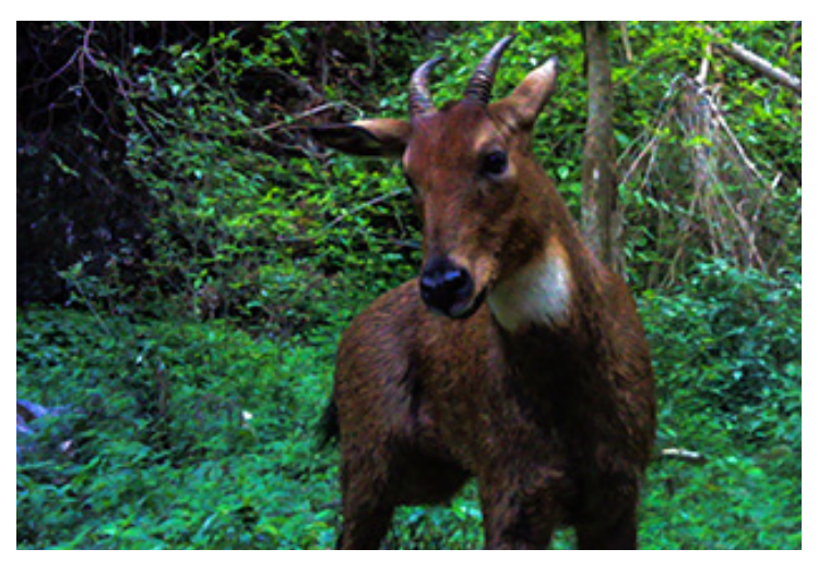
Himalayan Goral Naemorhedus goral Near Threatened