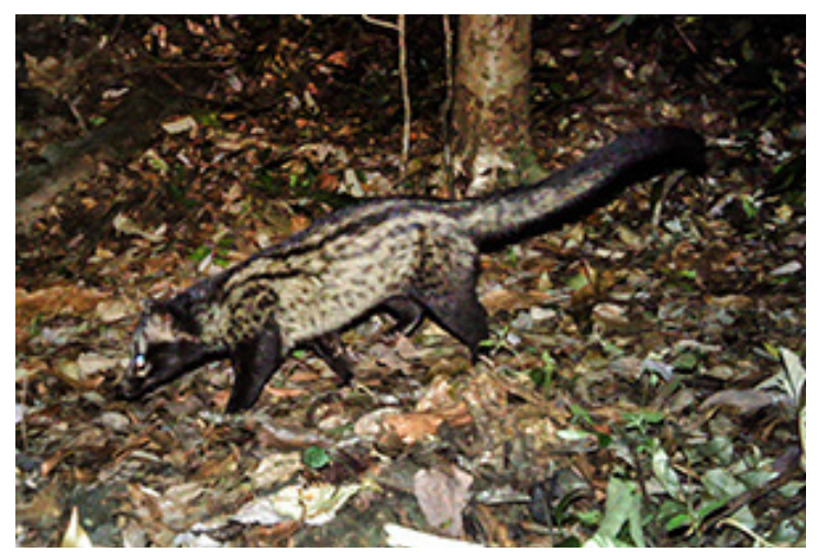
Common Palm Civet Paradoxurus hermaphrodites Least Concern