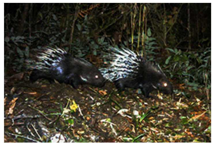
Himalayan Crestless Porcupine Hystrix brachyuran Least Concern