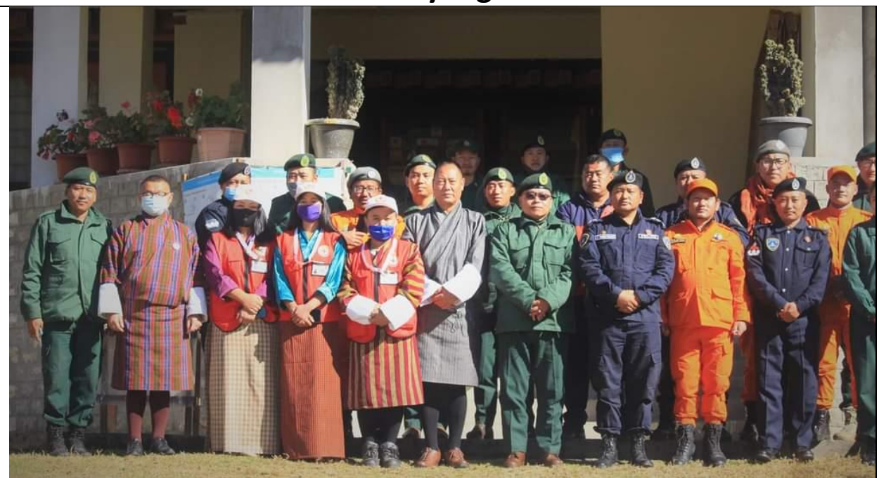
Inter-agency Forest Fire Coordinating Group 2021