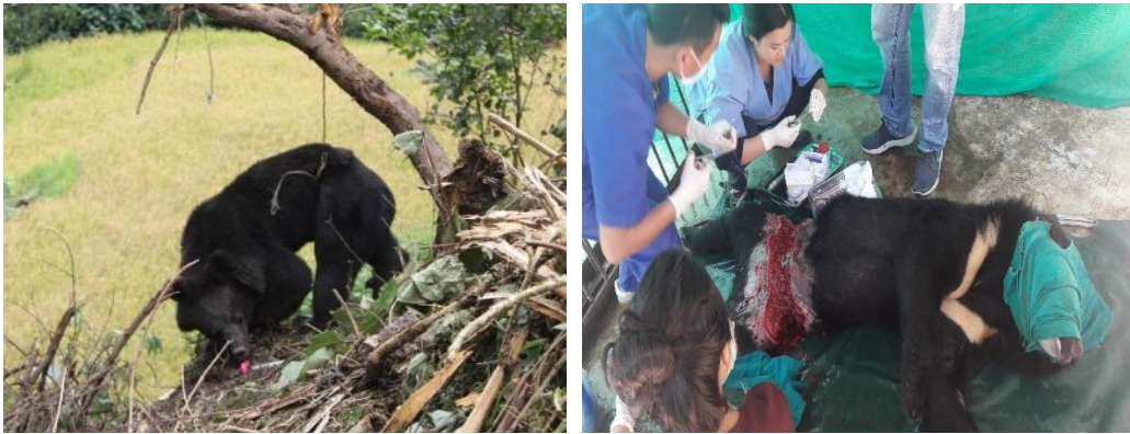
Figure 5. Figure 5. (L) A bear trapped in snare near agriculture field (R) Injured bear due to snaring in Haa