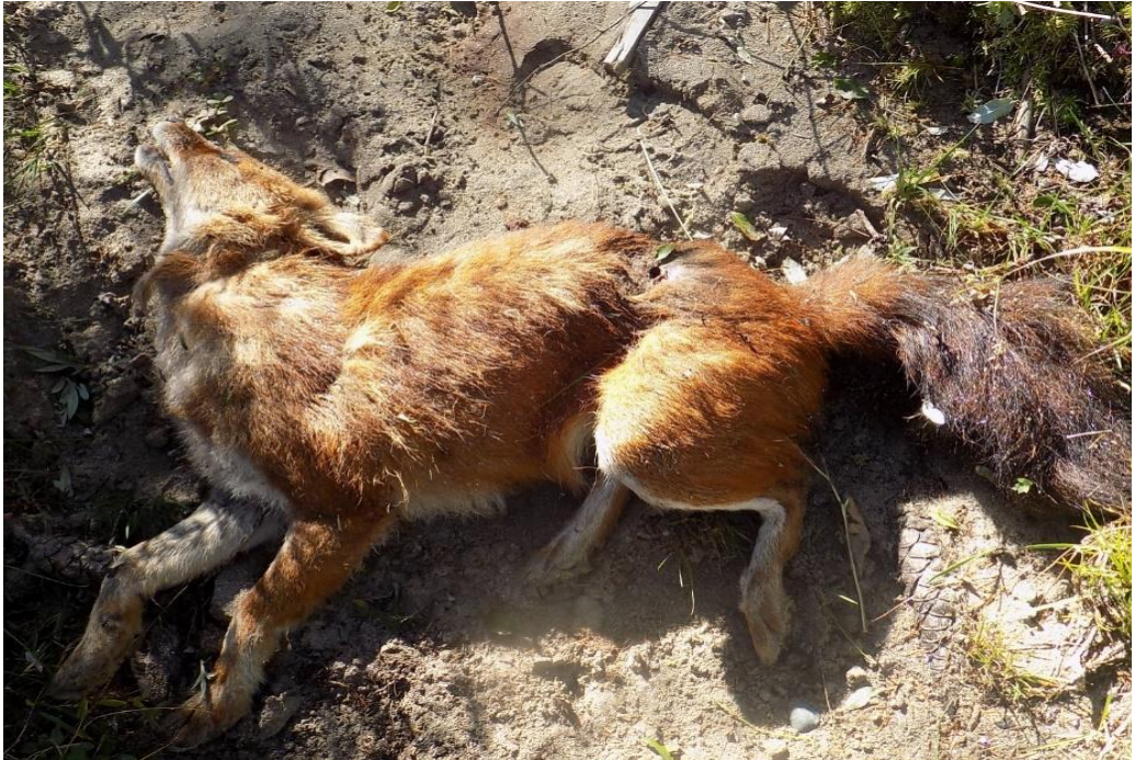
Figure 3. A dhole killed by farmers in Bumthang