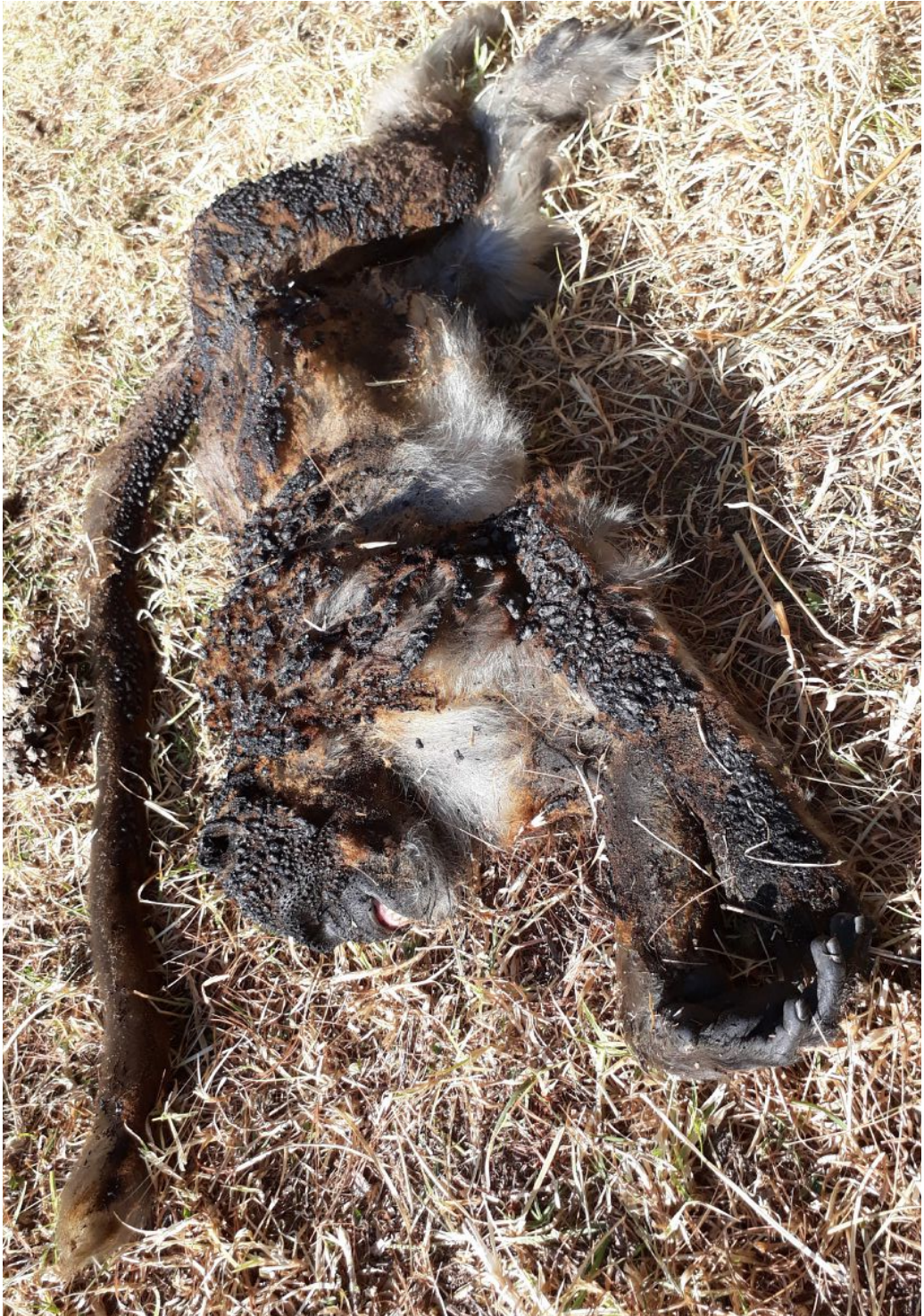
Figure 8. A gray langur electrocuted