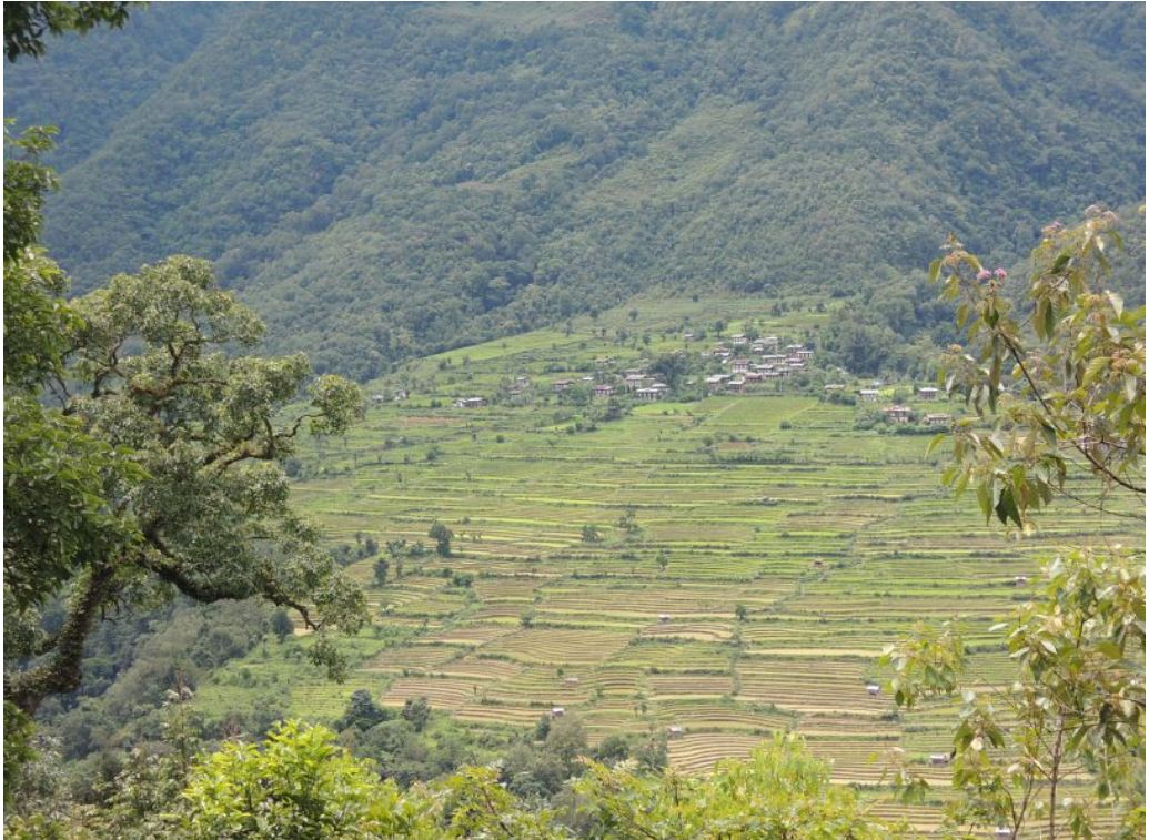
Figure 2. Nabji village in Trongsa

reside inside the protected areas in due recognition of their traditional rights (NCD, 2004). This is contrary to the situations in other countries where human settlements have been relocated outside of the protected areas to minimize conflicts (Rao and Geisler, 1990; McLean and Straede, 2003). Expanding human settlements and resource utilizations inside the protected areas is also a huge challenge in resolving human-wildlife conflicts in Bhutan.