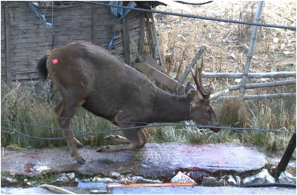
Figure 7. A sambar chased into human habitation by stray dogs