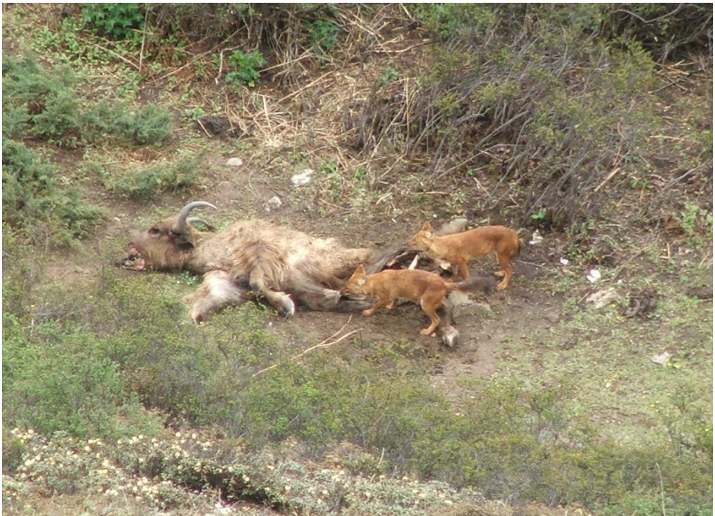
Figure 4. A yak killed by dholes in Lingzhi