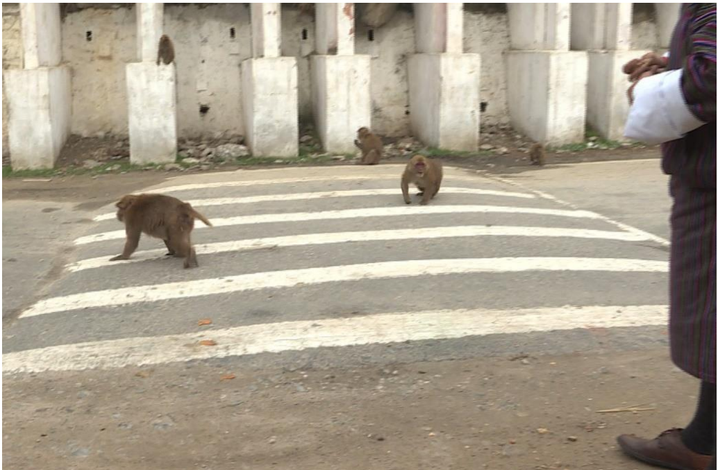
Figure 9. Macaques fed by humans along the highways

One of the main causes of human-primate conflict is the regular feeding of wild primates by humans along the national highways and at religious sites. Human provisioning of foods cause certain primate troops to become habituated to guaranteed source of foods and develop familiarity and closeness to humans and human settlements, thereby emboldening them to destroy human properties. For instance, regular feedings of gray langur at Dodeydra and Tango monasteries have resulted in langurs damaging the monastic serots and roofs (Thinley et al., 2016). The other causes on conflicts are related to habitat destructions and fragmentations due to developmental activities such as hydropower dam constructions which displace certain troops towards the human settlements.