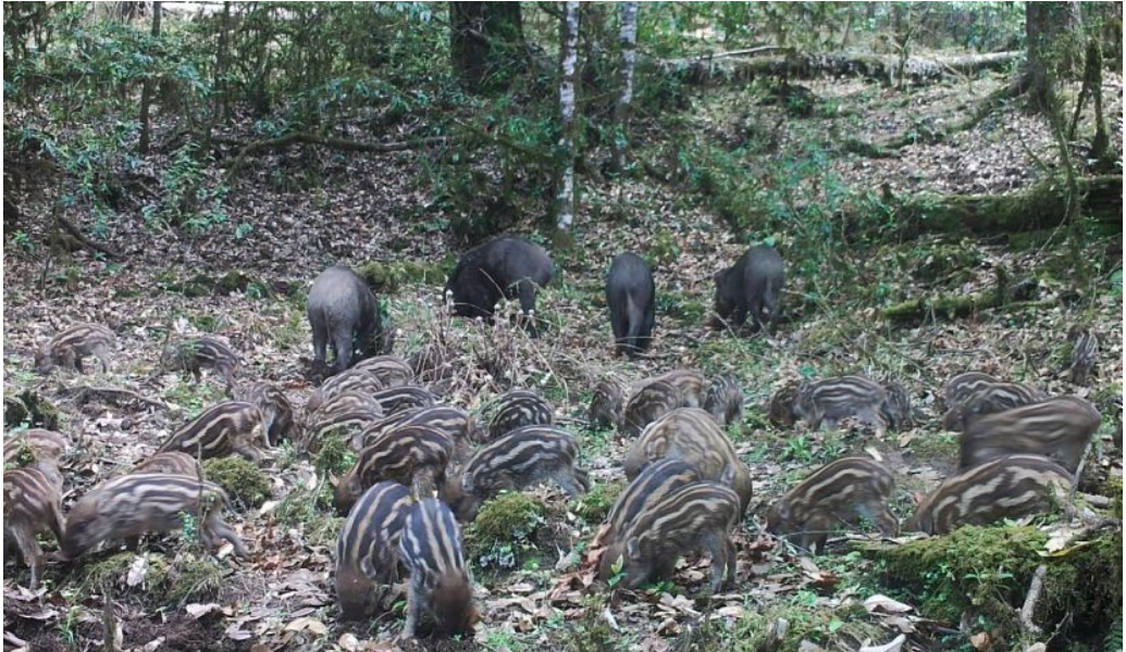
Figure 6. A camera trap picture of wild pigs in central Bhutan

hybrids, distinguished by an extra tooth on the lower jaw immediately behind the right canine, are said to be less fearful of humans and frequenting the crop fields and human settlements unlike the pure wild breeds. Majority of the wild pigs culled in 2004 during the wild pig management project were found to be hybrids (MoA, 2004).