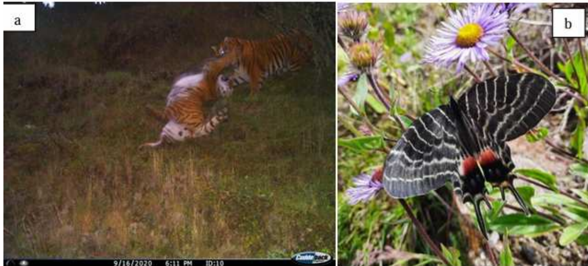
Figure 1: a. Panthera tigris and b. Bhutanitis ludlow (National butterfly)

Phrumsengla National Park are Chestnut-breasted partridge ( Arborophila mandellii ), Rufous necked hornbill ( Aceros nipalensis ) and beautiful nuthatch ( Sitta formosa ) listed vulnerable under IUCN list. PNP also records herpetofauna, fish and butterfly species. There are 3 species of amphibians, 12 species of reptiles, 4 species of lizards, and 7 species of fish.