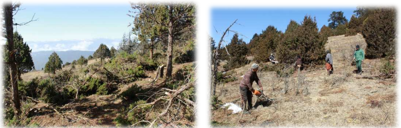
Figure 5: Cutting of unpalatable species

The activity amounting Nu. 250,000/- (Two hundred and Fifty Thousand) must be executed from October to December (Q4), 2025. The proposed site is at Zhubung, Bhim under Chumey Gewog, covering an area of approximately 1.11 hectares. The land allocated for this activity is currently used by the residents of the park for their livestock grazing in the summer with an