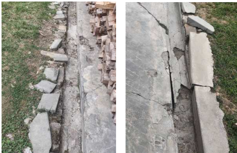
Figure 2: Current condition of the Drain