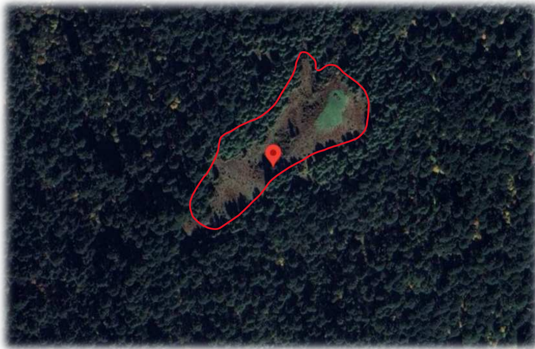
Figure 6: Zhubung Alpine meadow, Bhim, Chumey gewog