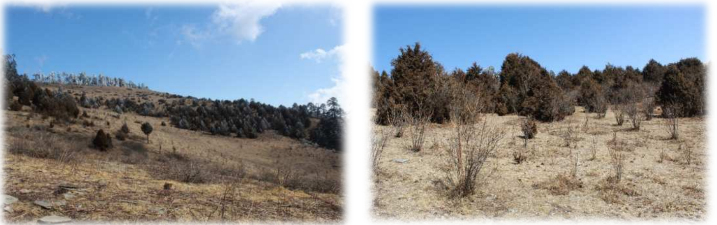
Figure 4: Alpine meadow at Norgyen, Ura.

Alpine meadow forms an integral part of wildlife habitats as well as livestock grazing grounds. Some of the park residents are dependent on livestock for their livelihood and the activity site is used as pasture/grazing land by the local herders. This activity is aimed at managing the alpine meadow habitat by removing/cutting unpalatable plant species (Trees, scrubs & herbs) overtaking the alpine meadows.