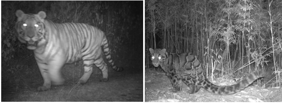
Figure 2 Tiger and clouded leopard captured in camera trap