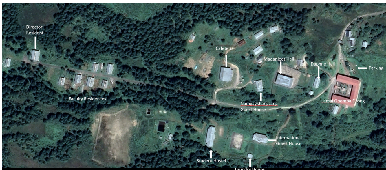
Figure 1 UWIFoRT Campus

Currently, apart from the certificate in forestry, the institute conducts various researches and provide regular professional training to the in-service foresters. There are three centers under the institute, Center for Forest Science and Technology (CFST), Center for Conservation (CoC), and Education and Capacity Building Services (ECBS). Under CFST, there are two sub-centers, Sub-tropical Forestry Center at Gelephu, Sarpang and NWFP Agroforestry sub-center at Darla, Chukkha.